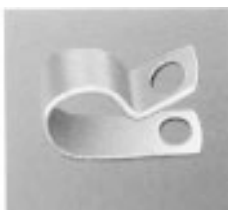
Steel Cable Clamp 8949 - .25 dia. 8950 - .312 dia.