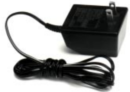
6973 UL 1310 Listing with UL 1411