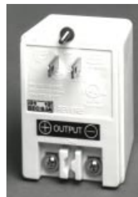
8065 Class II U.L.

GEORGE RISK INDUSTRIES, INC. G.R.I. PLAZA KIMBALL, NE 69145