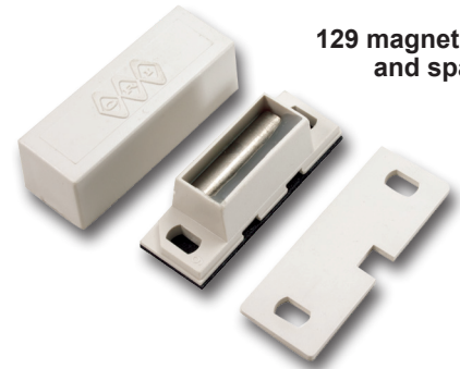
129 magnet, case and spacer