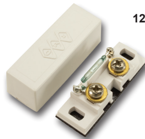
129 switch and case