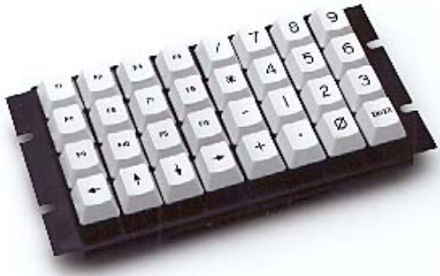
3032 ASCII, XT/AT Keypad