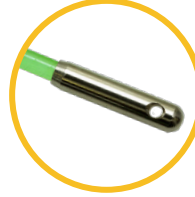
Metal Bullnose Connectors on both ends